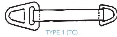
TYPE 1 (TC)

This type of sling has a triangle and choker fitting on either end. These slings are used in a vertical, choker, or basket hitch.