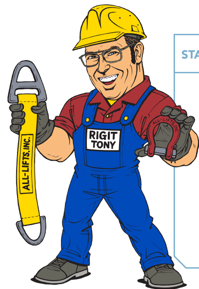
STANDARD EYE LENGTH FOR TYPE 3 AND TYPE 4 NYLON SLINGS